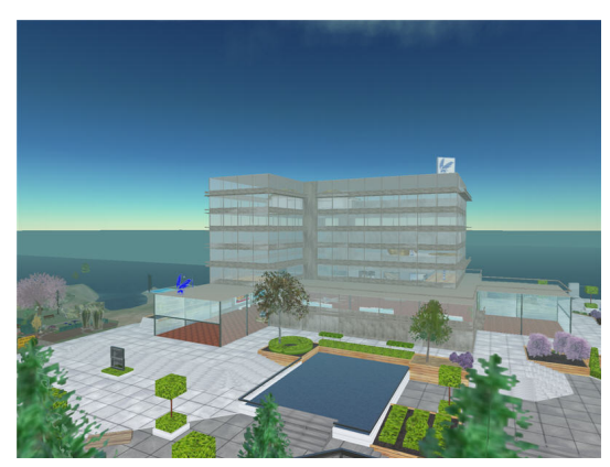
Fig 1. VU Campus - outside view

In December 2006, we discussed the idea of creating presence in Second Life. Our initial targets were to build a first prototype, to explore content creation in Second Life, to create tutorials for further content creation, and to analyze technical requirements and opportunities for deployment in education and research.