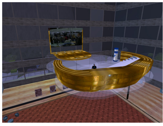
Fig 2. VU Campus – inside view

Two and a half months later, we are online, with a virtual campus, that contains a lecture room, a telehub from which teleports are possible to other places in the building, billboards containing snapshots of our university's website from which the visitors can access the actual website, as well as a botanical garden mimicking the VU Hortus, and even a white-walled experimentation room suggesting a 'real' scientific laboratory. All building and scripting were done by a group of four students, from all faculties involved, with a weekly walkthrough in our 'builders-meeting' to re-assess our goals and solve technical and design issues.